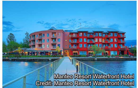
Manteo Resort Waterfront Hotel

The next BCSLA Board of Directors Meeting will be November 25, 2016 at 2:00 pm at the Port of San Francisco Room, Level 3, 1133 West Hastings Street, Vancouver, BC