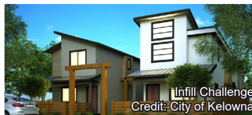
Infill Challenge