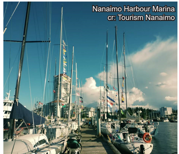
Nanaimo Harbour Marina