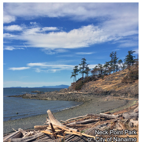
Neck Point Park