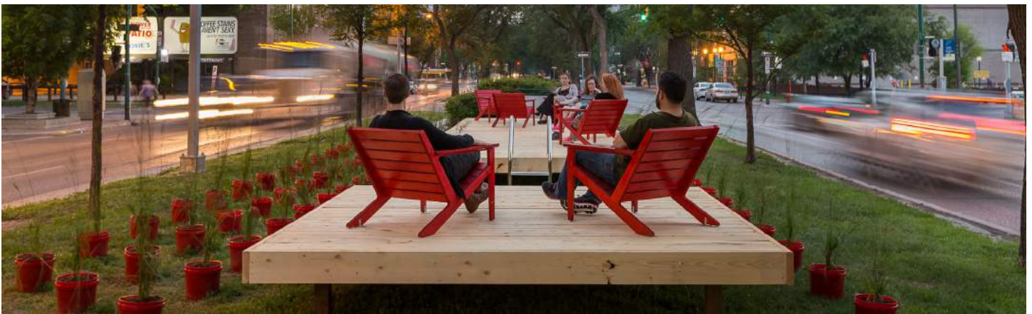
Sitting on the Docks of Broadway, 2015

Cool Gardens expands the vocabulary of garden design and serves as a learning tool. As we go back to our boulevards and backyards we hope to spread the creativity of Cool Gardens to the everyday practice of gardening in our city and region, creating in the process a dialogue on contemporary design with our sister cities across Canada and the world.