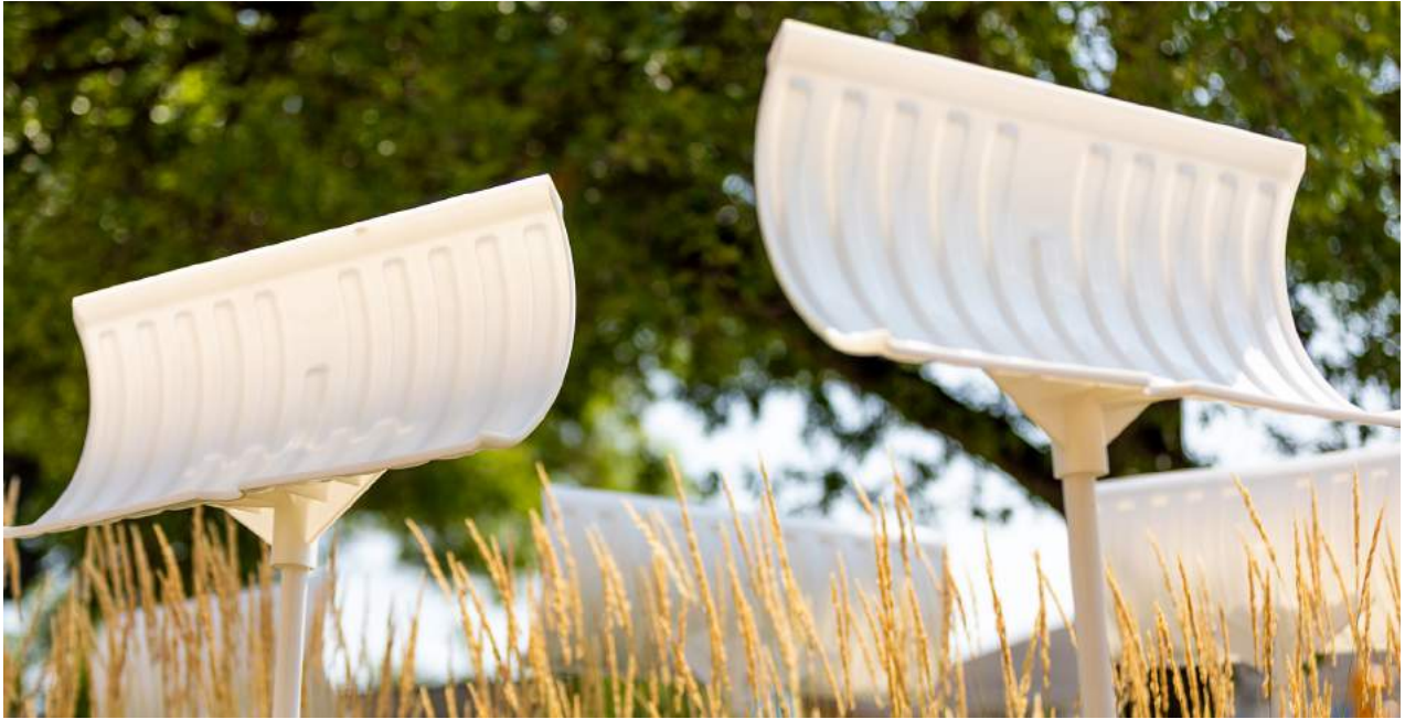
Shovel Garden, 2018