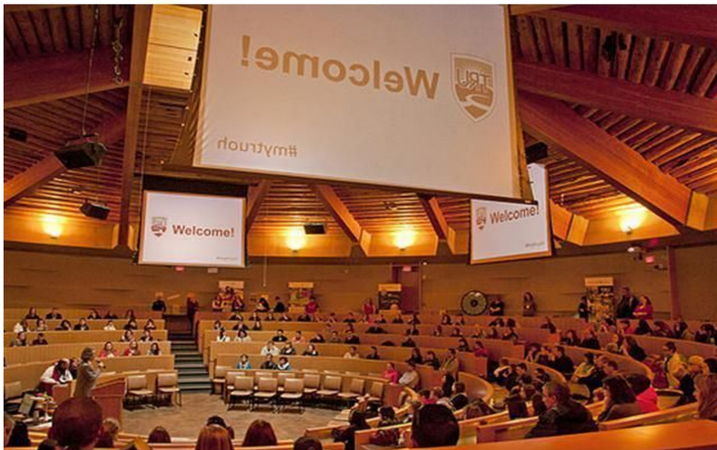
The Barber Center at Thompson Rivers University in Kamloops, British Columbia.

- First Nations - Salmon – Communities - Climate Change - Wildlife - Wildfires – Forest Industry - Jobs -