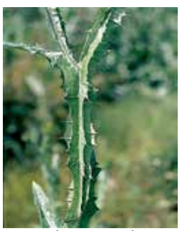
Stem with spiny-margined wings

Tall, coarse, spiny biennial thistle with large solitary flowerheads growing to 2 m or more in height; woody, branched stems with spinymargined wings; very large elliptic-shaped lower leaves grow to 60 cm long by 30 cm wide; upper leaves are smaller with irregularly toothed margins; very white hairy on undersurface; purple flowers are borne singly on 3 cm to 5 cm long branches