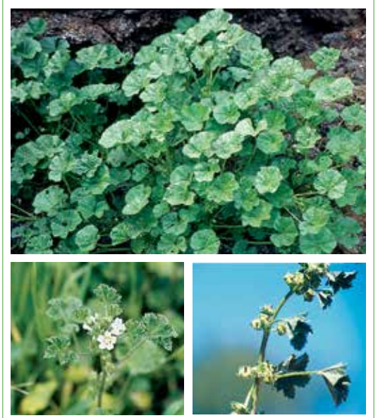
White to pale lilac flowers