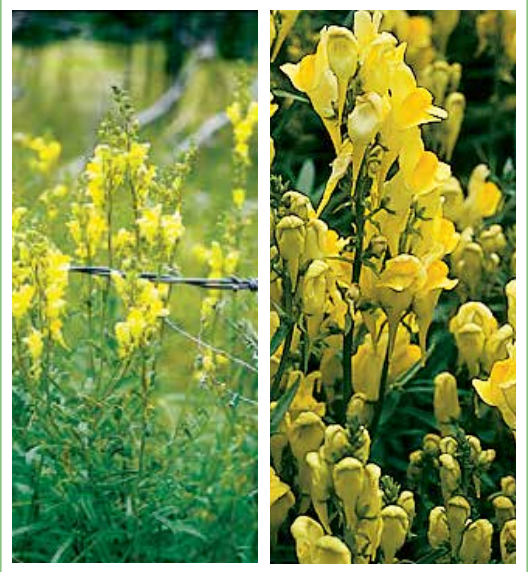
Yellow snapdragon-like flowers