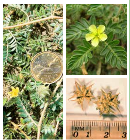
Spiny seeds break into sections when mature