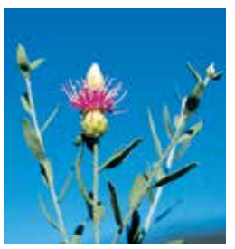
Purple flower with papery margined bracts