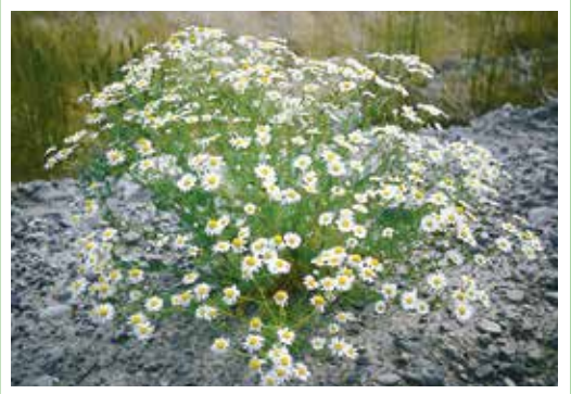
Fern-like finely divided leaves