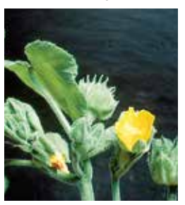
Showy yellow flowers and distinctive circular seedpods