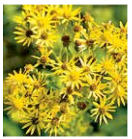
Ray flowers distinguish this plant from common tansy (Tanacetum vulgare)