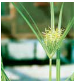
Flower cluster above long leaf-like bracts