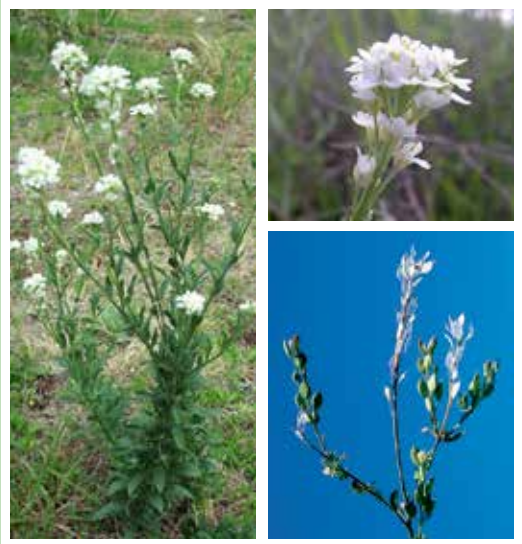
Flattened seedpods held close to the stem

Annual to short-lived perennial in the Mustard Family growing erect to 0.7 m tall; the whole plant covered with star-shaped hairs; upper leaves are elliptic and clasp the stem; white flowers with deeply notched petals; oval seedpods are 5 mm to 8 mm long, somewhat flattened and held close to the stem