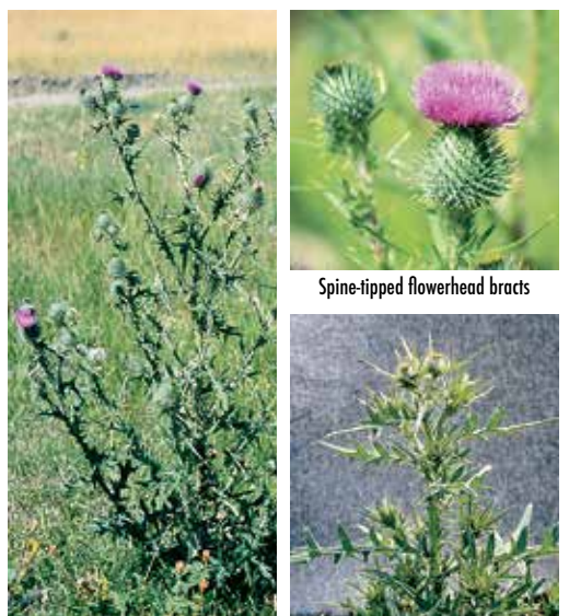
Stiff spines at leaf tips