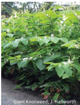
Giant Knotweed; J. Hallworth

Key Impacts: Knotweed establishment can lead to erosion of streambanks and increased sedimentation that can negatively impact salmon and other fish health and habitat, resulting in reduced harvesting. Knotweeds have caused extensive damage to homes and infrastructure. Blind spots created by heavy knotweed growth can hide signage and endanger pedestrians and roadside harvesters by blocking their view from drivers. Knotweeds can have significant impacts on food and medicinal harvesting by blocking access and outcompeting native plants.