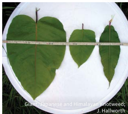
Giant, Japanese and Himalayan Knotweed