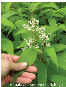
Himalayan Knotweed; N. Page