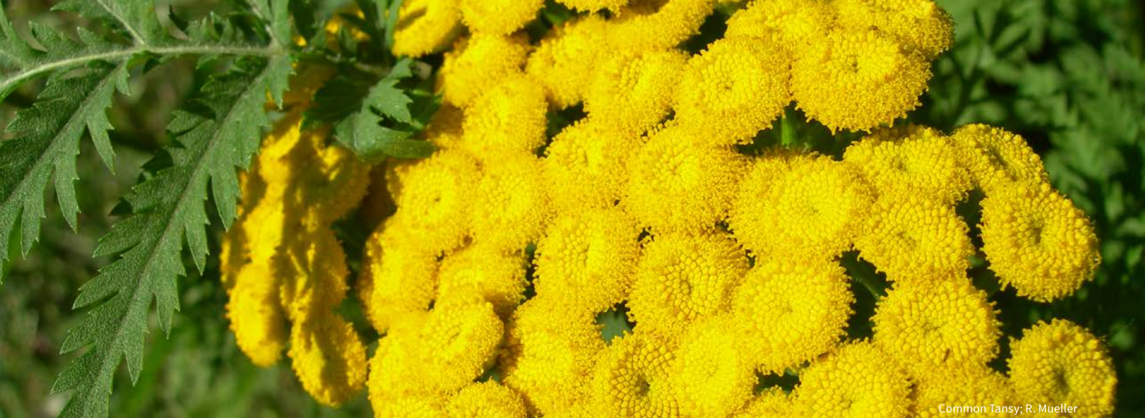
Common Tansy