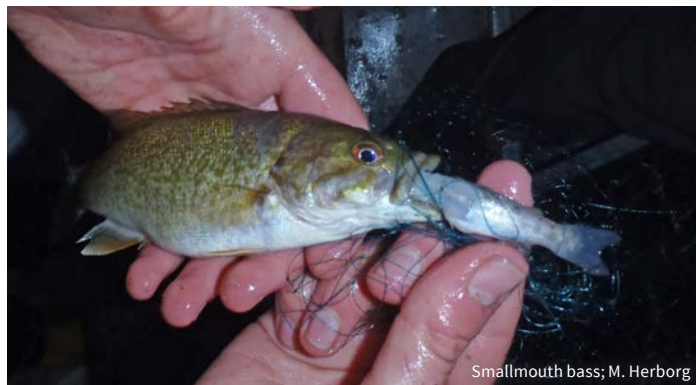
Smallmouth bass; M. Herborg

Invasive Species Council of British Columbia. (2014). Knapweeds. Retrieved from https://bcinvasives.ca/documents/Knapweed_TIPS_Final_08_06_2014.pdf