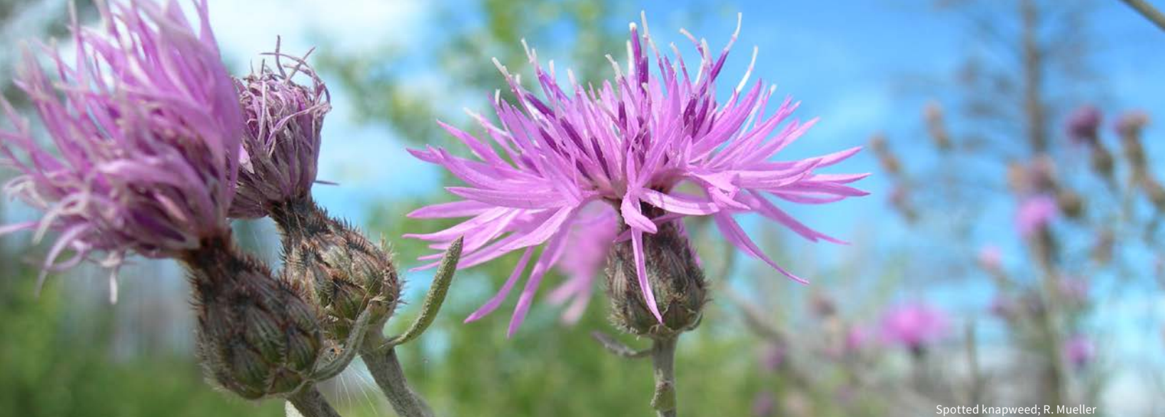
Spotted knapweed