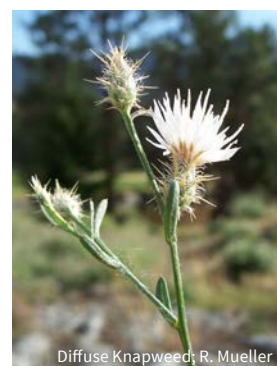
Diffuse Knapweed