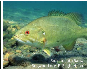
Smallmouth Bass

Current Distribution: Lower Mainland, Vancouver Island, Okanagan, Thompson, and Kootenay regions.