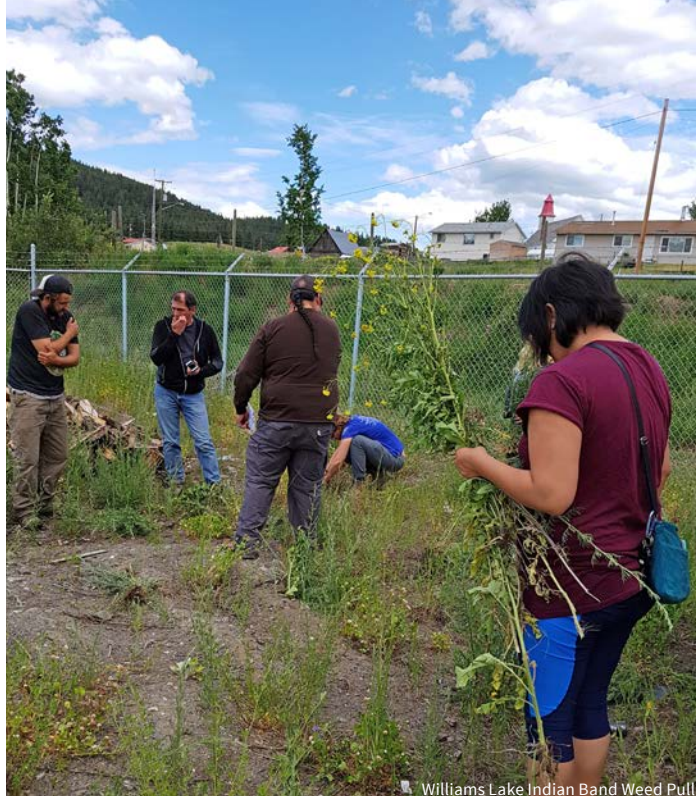
Williams Lake Indian Band Weed Pull

and is unpalatable and even harmful to grazers by causing cumulative liver damage when ingested. Infestations in pastures and hayfields can significantly reduce crop productivity.