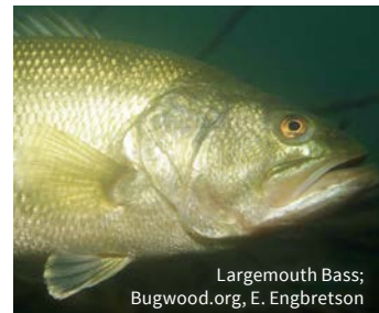
Largemouth Bass