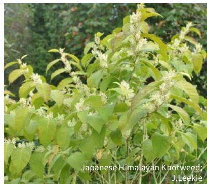
Japanese Himalayan Knotweed