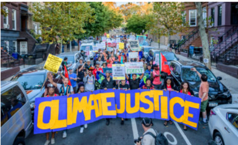
Demonstrators march in Sunset Park, Brooklyn last September in support of community-led climate justice initiatives.

These things, to me, are connected. It's comfortable for people to separate them, because remember that the environmental movement, the conservation movement, a lot of those institutions were built by people who cared about conservation, who cared about wildlife, who cared about trees and open space and wanted those privileges while also living in the city, but didn't care about black people. There is a long history of racism in those movements.