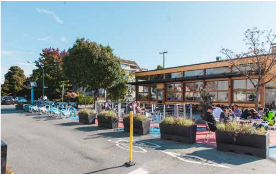
14 th and Main Plaza.

Street, just south of Robson Street, with picnic tables, stools, flowering planters, and a bright pink bike corral. From day one, the new gathering space attracted a diverse crowd of seniors, young adults, families, and other locals during the day and well into evenings – chilling to music and enjoying late night eats. The plaza is currently stewarded and programmed in partnership with the Robson Street Business Association. Activities in the space have included: a free public spin class, a pop-up dance show, a wedding proposal, and many impromptu performances on the public piano.