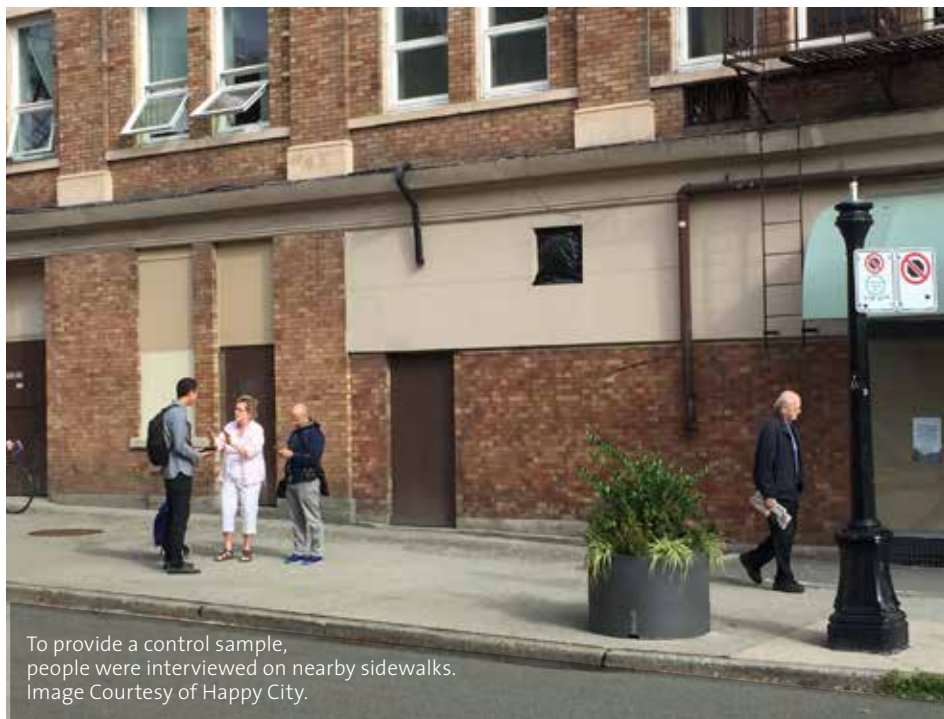
To provide a control sample, people were interviewed on nearby sidewalks.

Public realm stewardship brings its share of difficulties. Unlike more tangible public amenities, such as community centres, pools or libraries, public spaces don't have defined funding for ongoing operations. Further, there is no single department responsible for all decision-making relating to public space management, and roles and responsibilities are not always clear. And, there are inevitable difficulties in balancing emerging tensions and conflicts – from operational challenges such as noise, cleanliness, bird feeding, or smoking, to more complex issues ranging from the commercialization of public space, to ensuring spaces remain inclusive for people from all social and economic circumstances.