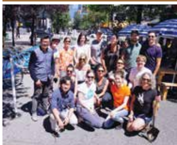
Cover image: Astrantia