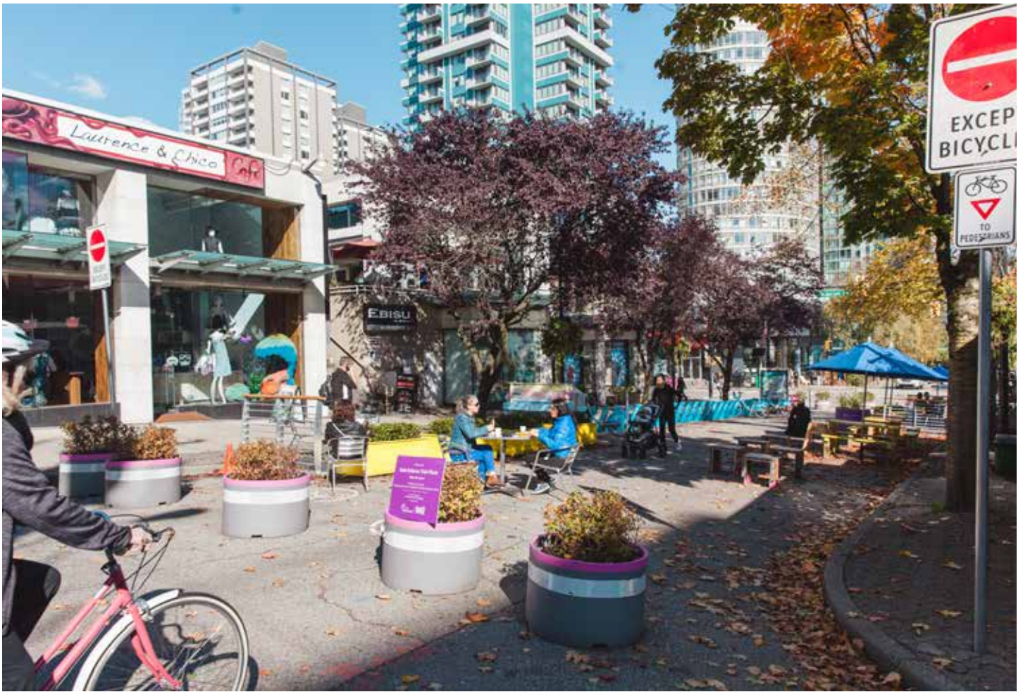
Bute-Robson Plaza looking north.