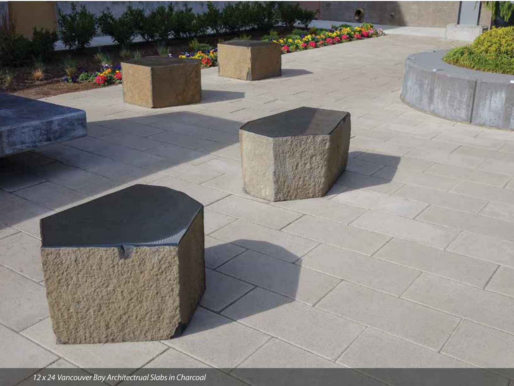
12 x 24 Vancouver Bay Architectural Slabs in Charcoal