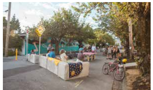
Music and Ping Pong in the Helena Gutteridge Plaza.