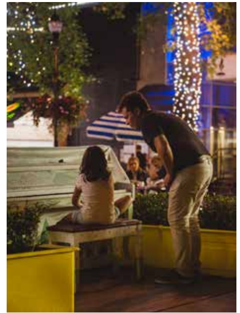
Keys to the Street is a non-profit which provides a piano to a variety of indoor and outdoor public spaces.

Pavement-to-plazas add public space and public life to communities. They offer respite from busy streets and noisy car traffic, bridge neighbourhood and commercial activities, integrate walking, cycling, and staying, and according to research, improve wellbeing.